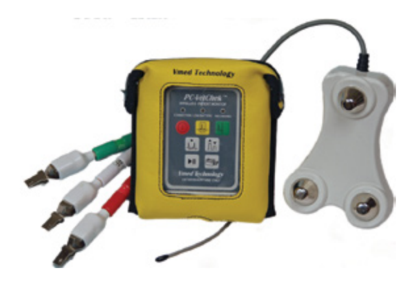
Includes protective hanging pouch, low force ECG skin clips, ECG chest probe and temperature probe.

Includes three apps for real-time monitoring, file recall and ECG interpretation. Use the Remote Connect feature to link to each app from your iOS, MacOS, Android, Google, Blackberry or Microsoft device. Monitor from your office, home or anywhere in the world. Consultants can view real-time display or saved files to assist in diagnosis.